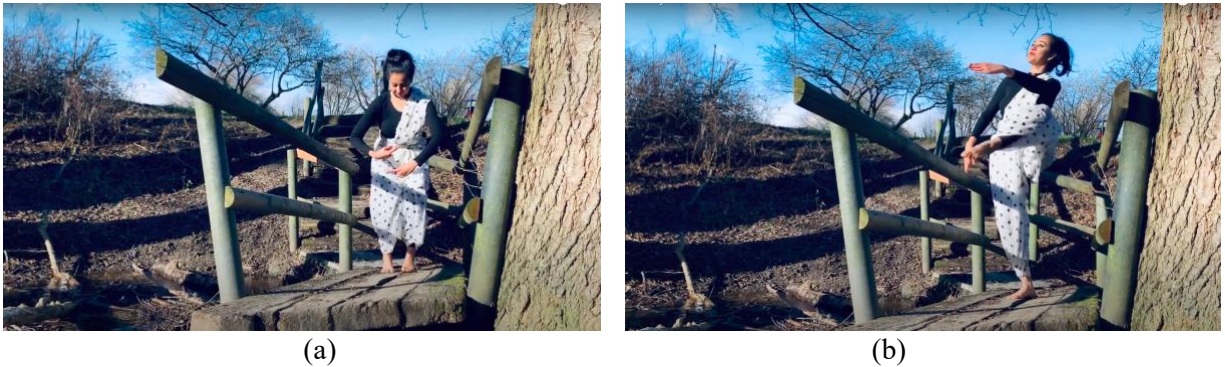
Figure 3: Physical infinity: (a) time cycling to infinity, (b) foot and hand pointing towards infinite space.