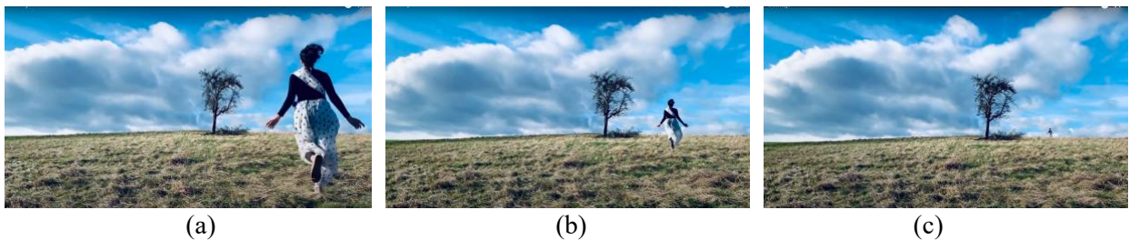
Figure 4: Embodied metaphysical infinity: (a) running towards the ultimate reality, (b) further into the ultimate reality, (c) turning back as it was endless.