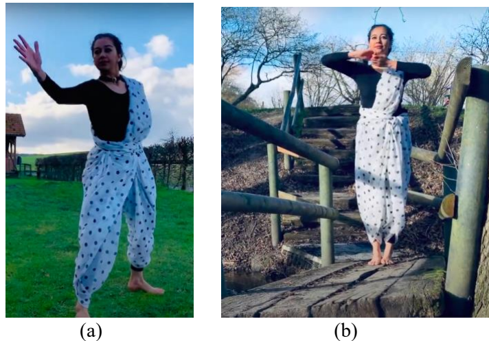
Figure 5: Set design: (a) saree with numerous dots, (b) staircase implying leading to infinity.