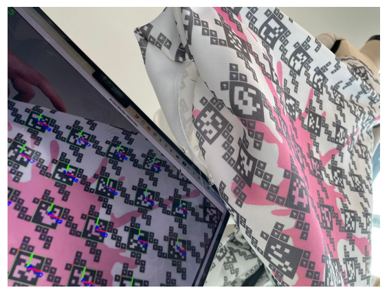
Figure 2: The recognizer in action.

The marker arrangement maintains the square markers' appearance. Each marker is sufficiently (Euclidean) distant from the others and their surrounding decorations, so their edges and corners remain intact.