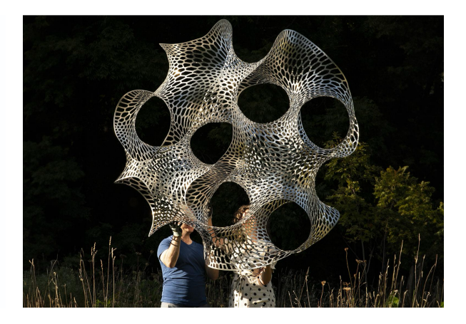
Figure 4: Corollaria Gyroid sculpture.