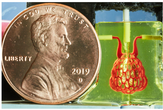
Figure 2: A 3D-printed alveoli-like structure.