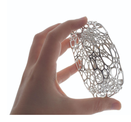
Figure 3: A sterling silver Cell Cycle bracelet.