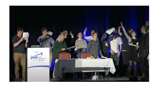
Figure 3: Scene from "Equinox" in [3].