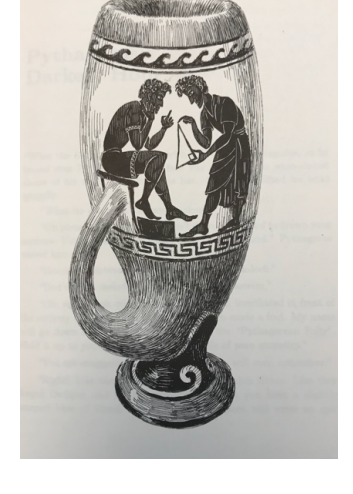
Figure 2: Figure by Pier Gustafson from "Pythagoras's Darkest Hour" in [2].