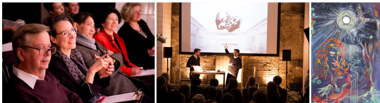
Figure 3 : a) The jury b) Presentation of a hanging sculpture c) Draft for an oil painting

All ideas were presented on stage in front of the jury, other participating teams and interested guests. People from different fields of art and science were invited to be members of the jury. They evaluated all submissions and selected seven participants to be supported with grants adding up to 3738 EUR 2 for the realization of their creative work. All participants, not only the selected ones, are invited to show their final Math Creations at the exhibition event.