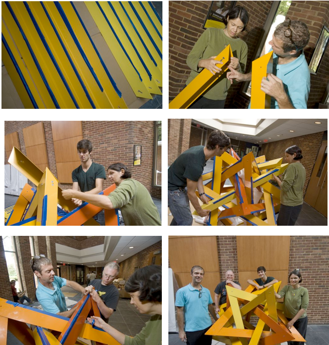
Figure 4: Final assembly

scratches on the powder coating. The final structure weighs only 100 pounds and was professionally installed so we are confident it will safely hang for many years.