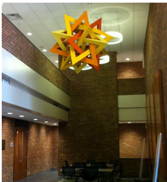
Figure 1: Sunshine

The author recently completed her first large metal sculpture. Sunshine (figure 1), a five-foot diameter rendering of five intersecting tetrahedra in powder coated aluminum, was inspired by Tom Hull's origami model of this polyhedron. The piece has been installed in the Copley Science Center at Randolph-Macon College, where it hangs from the ceiling in the two-story entrance hall. This paper tells the story of attempting an ambitious project with no prior experience.