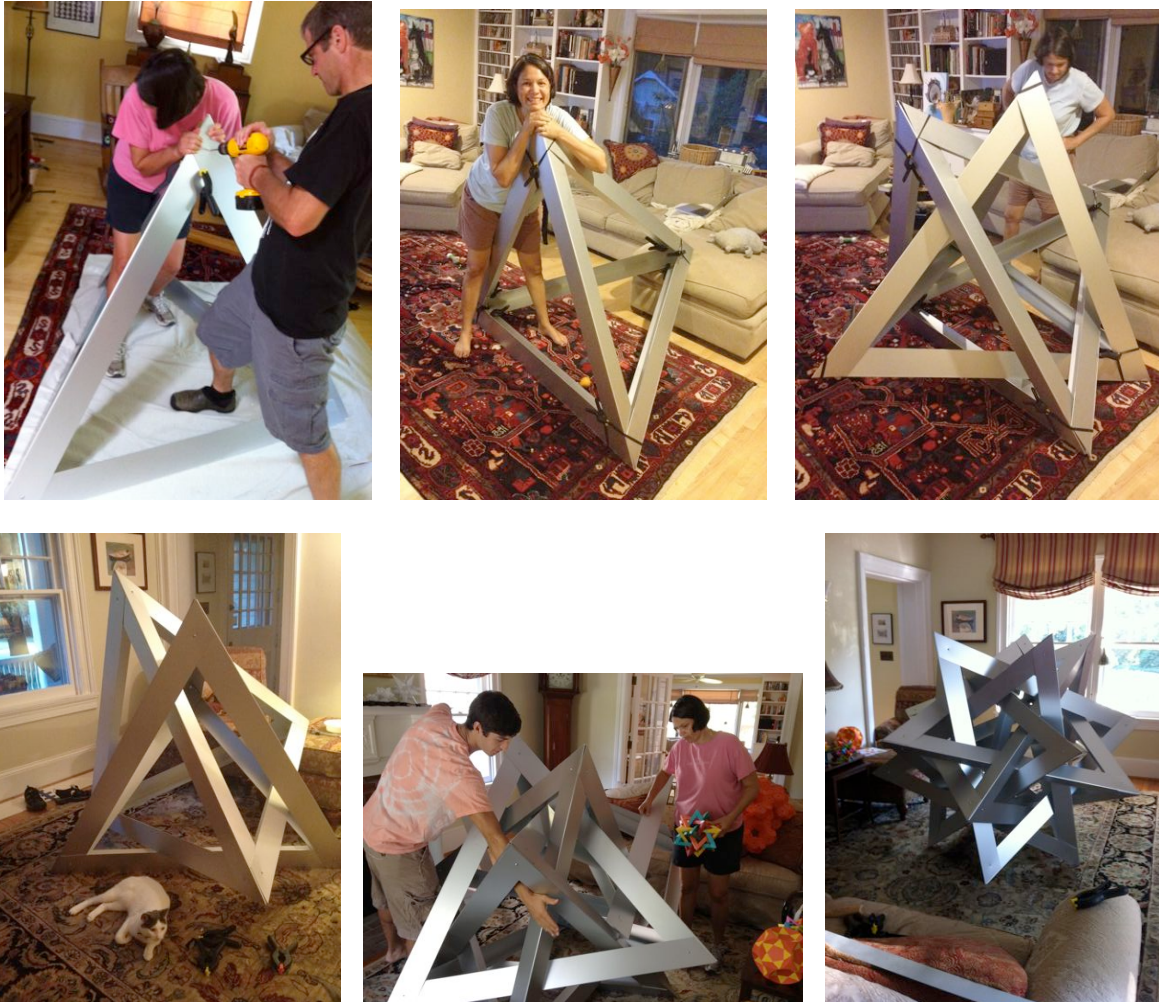
Figure 3: First assembly

before investing in the powder coating. It took several days, lots of Band-Aids, and some frayed nerves to get the 60 holes drilled and the FIT assembled, but it fit together (see figure 3). We used a rubber mallet a few times to bang pieces into place before we developed a technique of flexing the metal to make each piece slightly flatter, allowing it to slide into place without too much force.