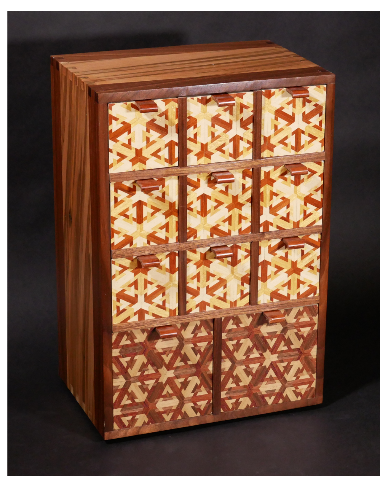
Figure 5: Example of both versions of the Borromean Rings Yosegi used to decorate an Apothecary cabinet[3]