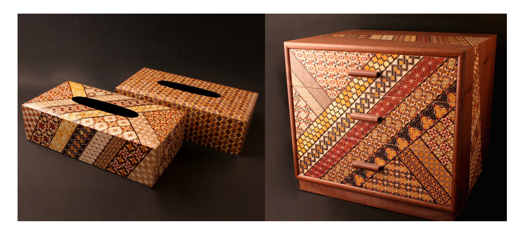
Figure 1: Examples of Yosegi Zaiku. These two pieces are samples of the work of the Japanese master Ichiro Ishikawa of Hamamatsuya in Hakone, Japan [1]