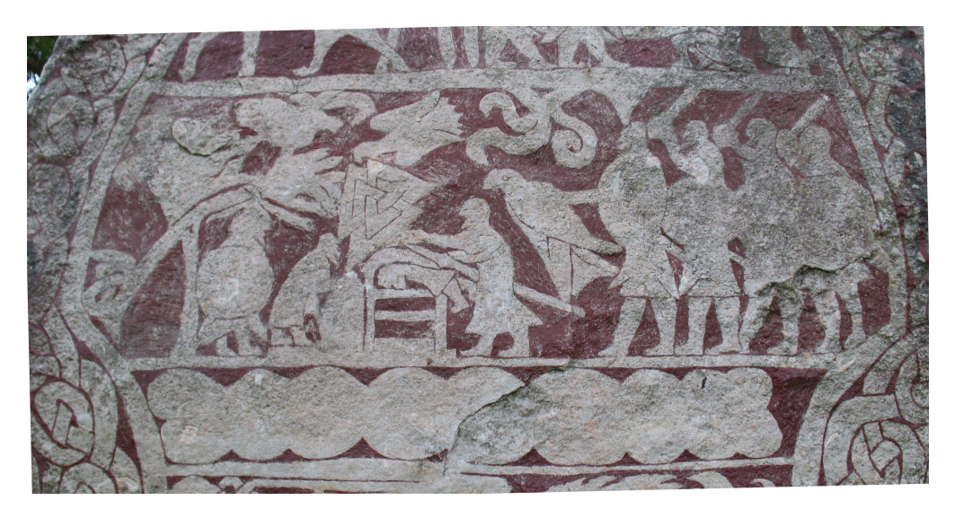
Figure 2: Example of the Borromean Rings appearing as a Valknut. This example is from one of the 7<sup>th</sup>-century Stora Hammers stones in Gotland, Sweden [2].