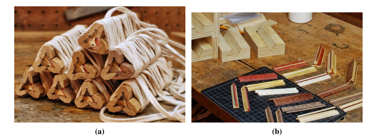
Figure 3: Building up the layers of the Borromean rings pattern cell. (a) the three pieces of the inner layer, glued and "clamped" via cauls and tightly wound cord, (b) building the middle layer on top of the inner layer