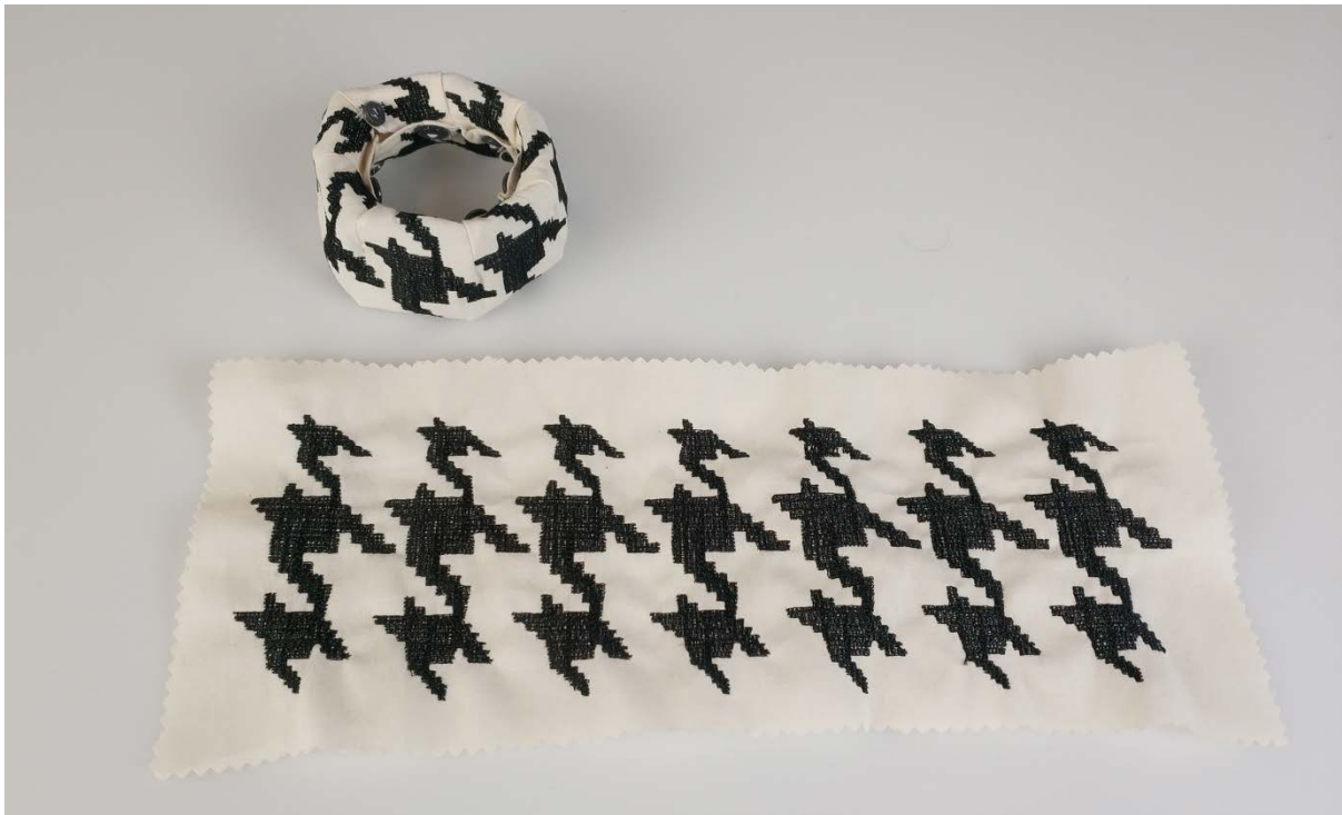
Figure A1: Torus with button/button-hole closure. Embroidered fabric used for the torus. (C) Loe Feijs.

In this supplementary document we show images of a few other explorations related to the orbifold concept, applied to pied-de-poule. The explorations are done using unbleached cotton and machine-embroidery. Later, these models can be styled in different materials and colors.