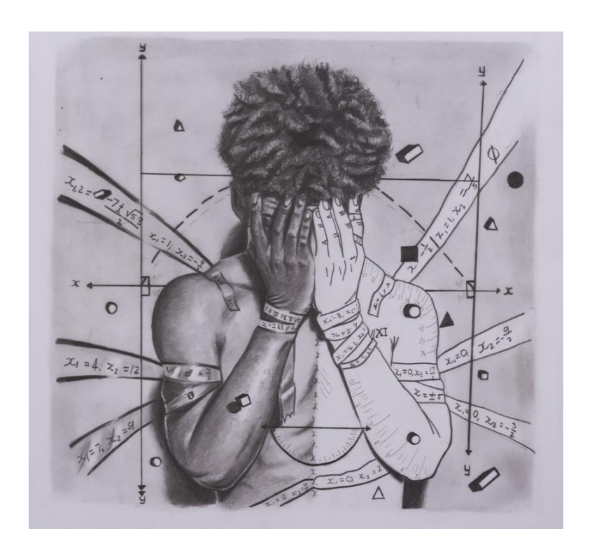
Figure 2: "The Stressed Vitruvian Man", a submission for the first Children and Youth Mathematical Art Exhibit in South Africa, curated by Werner Olivier and Carine Steyn.

The photograph of the artwork and the attached verbal interpretation are the items that are then considered "data" for scientific analysis if there is an interest in research. Parents', teachers' and children's consent is obtained upon submission, in accordance with the ethical and data protection guidelines. The team of organizers, researchers and teachers then conducts a first pass through the collection to make initial interpretations based upon their own aesthetic, mathematical, and artistic insights. These initial interpretations and selections are then brought to the whole group for discussion and winnowing to a manageable size. This process is done in verbal communication and is followed by a process of synthesis that brings into a cohesive whole the thoughts of the team. This then becomes the cognitive source-code for the "rhizomatic" analysis, as it is introduced below.