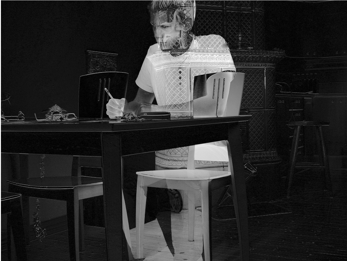
Figure 5: Tuomo Rainio: Letter (2006), 38 x 50 cm, digitally processed photograph printed on offset film.