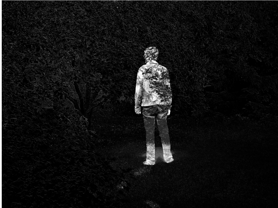
Figure 3: Tuomo Rainio: Garden (2006), 38 x 50 cm, digitally processed photograph printed on offset film.

Visual artist Tuomo Rainio has applied the idea of time derivatives to photography and video processing. Rainio's work is based on the idea of representing time through changes over time. Instead of showing a photograph that freezes the moment, Rainio has composed the images from two photographs depicting two moments (Figure 3). As a result, human figures appear in the scene both absent and present.