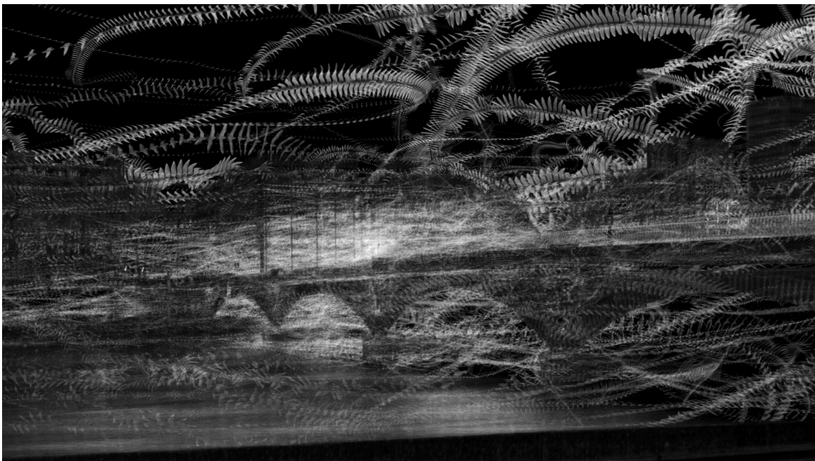
Figure 4: Single frame from Tuomo Rainio: Pont Austerlitz II (2012), digital video HD, 4 min. 15 sec.

Visual artist Tuomo Rainio has applied the idea of time derivatives to photography and video processing. Rainio's work is based on the idea of representing time through changes over time. Instead of showing a photograph that freezes the moment, Rainio has composed the images from two photographs depicting two moments (Figure 3). As a result, human figures appear in the scene both absent and present.