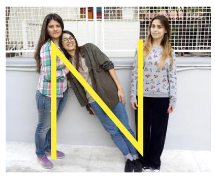
Figure 3 a, b, c: Maths in Motion Different Levels exercise by SciCo, Greece. Low level (a), middle level (b) and high level (c).