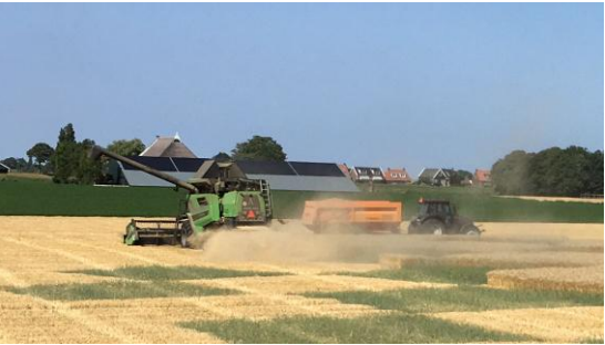
Figure 3: Harvesters 'deleting' Land Art.

A professional land surveyor put in place the most important wooden markers in each field, using a GPStool. The artists themselves had to complete the supplementary markers and the execution of their design. Flattening the crop with wooden planks was not always a good practice. The young and green crop tended to rise up again. In some cases mowing was a better method. Unfortunately this land art is temporary. Harvesters put an end to all projects. See Figure 3.