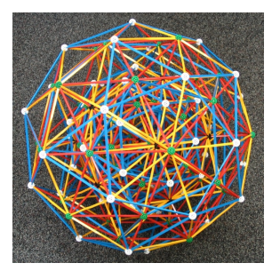
Figure 2: A Zometool model of a partial 3 D projection of the E<sub>8</sub> root system.