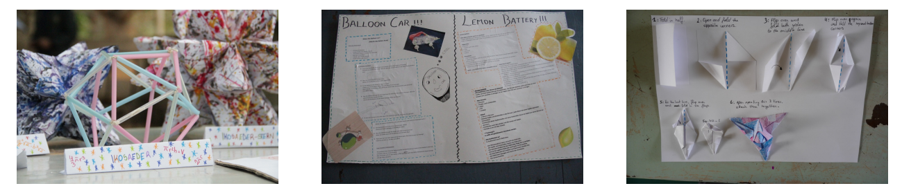
Figure 3: Labels, description boards, and instructions

Exhibits may be presented with labels or description boards, hands-on exhibits might need instructions or suggestions for the user (see examples in Figure 3). The teams need to be aware of each other's work during the whole production phase in order to create an appealing and consistent exhibition experience for the visitors.