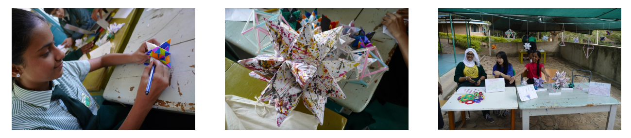
Figure 4: Bascetta Star, details and setup in the exhibition

Since each Science Spaces exhibition depends on the participants creating the exhibits, every exhibition is different. In this section, we present some specific exhibits and exhibition setups of past Science Spaces workshops. In every exhibition, there have been several exhibits regarding different topics. One example is the Bascetta origami star [1] (see Figure 4). It became an all-time favorite in the Science Spaces workshops. The Bascetta star combines the mathematics of polyhedra and three-dimensional symmetry with artistic techniques using simple materials such as paper. Starting from 2-D shapes, mathematical and geometric concepts are intuitively perceived and spatial understanding is stimulated.