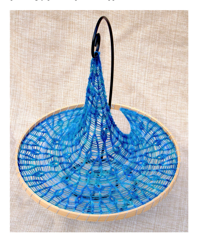
Figure 4: Fibonacci Downpour, merino yarn, cotton thread, and embroidery hoop, 2015.

Since the Fibonacci numbers grow asymptotically exponentially, in principle the fabric produced by this recursion is closer and closer to having constant negative curvature as more and more levels are added. In practice, the mesh is so loose that the form the knitting takes is just as defined by how the knitting is blocked and mounted as by the stitch pattern itself. With the bottom lashed to a circular hoop, the fountain of yarn takes on a pleasingly pseudospherical appearance, even if it is only a mirage.