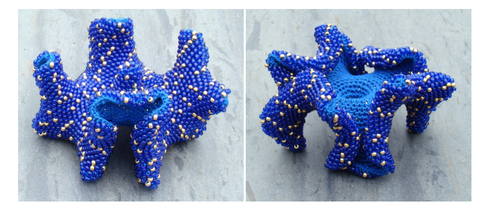
Figure 2: Hyperbolic Constellation, glass beads and crochet cotton thread, 2014.

The key to hyperbolic crochet, as thoroughly discussed in Daina Taimina's landmark book [3], is that you can achieve constant negative curvature in crochet (and for that matter, in knitting) by distributing increases so that the number of stitches per row grows exponentially. More precisely, if you fix a natural number n and make an increase every n stitches throughout the crochet, you will produce an excellent approximation of a surface of constant negative curvature. This elegant pattern is what inspired me to learn crochet in the first place, and I returned to the idea in bead crochet for my 2014 artwork Hyperbolic Constellation (Figure 2). Here, every sixth bead is gold, and these gold beads mark the locations of the increases, demonstrating the unseen complexity in Taimina's hyperbolic technique.