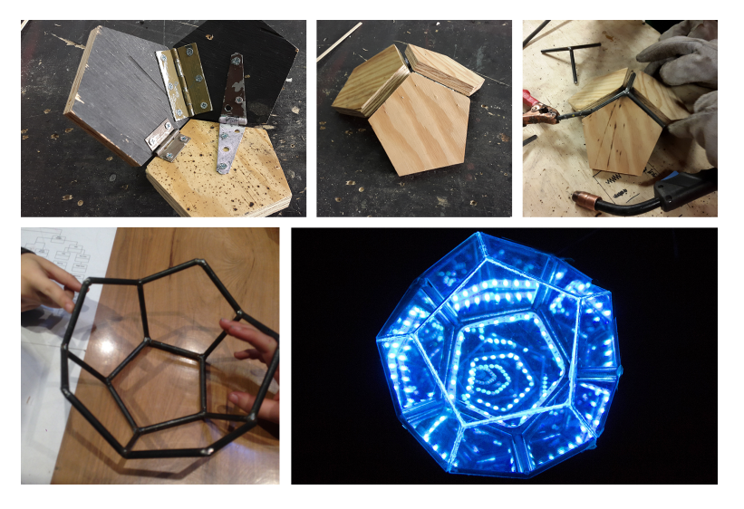
Figure 1 : Dodecahderon Infinity Room Final Project

One group decided to make a dodecahedron infinity room. They first constructed a pentagon using only a compass and straight edge on paper to trace onto acrylic plastic two-way mirrors. They discovered that this method had flaws once they traced on the mirrors, so they chose a length and computed the interior angle of a pentagon and set the chop saw to that angle. In order to hold their dodecahedron together, they welded a base for it (See Figure 1). The top row of the figure shows the jig they created to weld the rods together. The bottom row shows the welded base and the completed project.