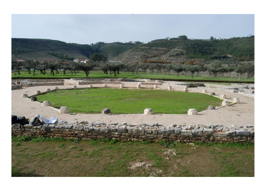
Figure 1 : Overall view of the peristyle

This is a hands-on activity, related to the paper "The Roman Villa in Rabaçal and Álvaro Siza" [1].