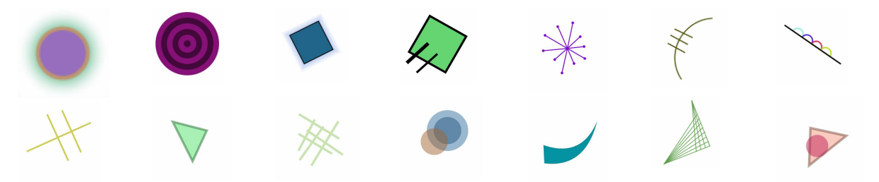
Figure 1: From left to right, some of the programmed objects: Sun, Target, Square 2, Asterisk, Straight Line-Arcs, Mountain, Unequal, Triangle, Fence, Eclipse, Horn, Space, Triangle-Ball.

In this chromosome, each object has its specific attributes that are necessary to generate them and they are all randomly initialized in the first generation. Expression is the process by which the phenotype is generated from the genotype. In the MasterPiece environment, the expression of each object has a specific generating method. The background of a composition is treated as an object while the dimensions are pre-defined.