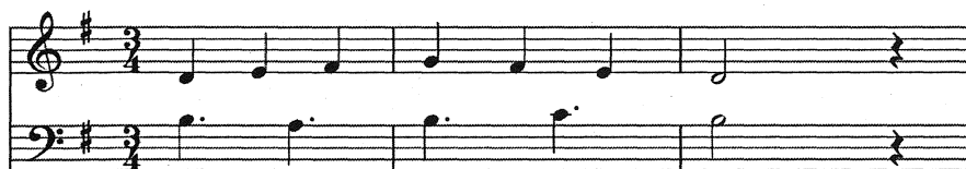
Example 1: Conjectural passage showing a 3:2 rhythmic relationship.

Over a span of almost 50 years, Nancarrow wrote 49 numbered “Studies” for the player piano. He used ratios in several different ways in these pieces, and many of his ideas—particularly the earlier ones—are obviously influenced by the ideas of Henry Cowell as set forth in New Musical Resources of 1930 [3]. It was Cowell who first presented the idea of relating simultaneous tempos to acoustical pitch ratios found in musical intervals and chords. For instance, the interval ratio for the purely-tuned perfect fifth, 3:2, could be represented rhythmically in a passage such as shown in Example 1.